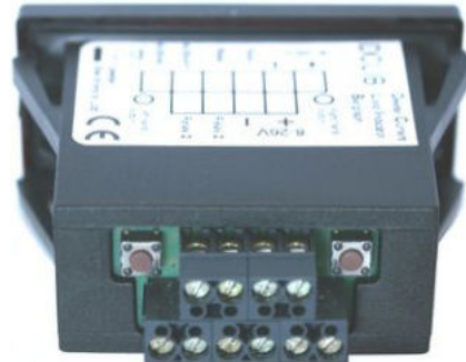
Rear view of the DCLIB

The DCLIB (Deeter Current-Loop Indicator - Bargraph) is an easy-to-mount display module designed to work with any 4-20mA or 0-20mA process sensor. The display consists of a 20-segment bar LED that can indicate the loop current with a 5% resolution*.